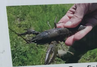
Native Virile Crayfish

Red Swamp Crayfish construct burrows that damage ponds and drainage systems.