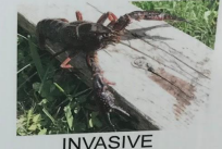
INVASIVE Red Swamp Crayfish