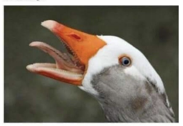
WHY DOES IT HAVE TEETH ON ITS TONGUE

We teach kids to fear animals like rats, snakes, spiders, etc. that are harmless 99% of the time but do we ever warn them about the real danger